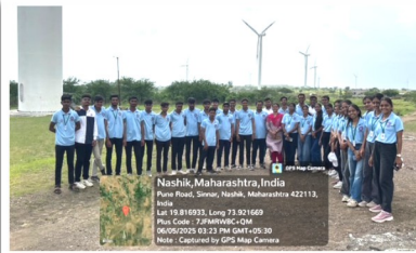
GREEN Energy Visit by NSS Volunteer on 05/06/2025