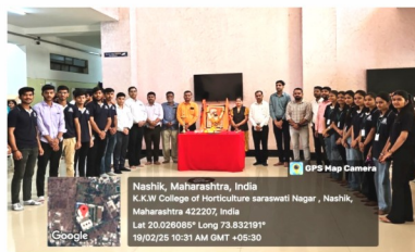
▶ Celebration of Birth Anniversary of Great Warrior Shivaji Maharaj at K.K.Wagh College of Horticulture, Nashik on 19/02/2025