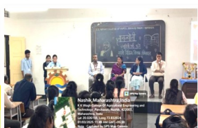
Kranti Jyoti Savitriaii Phule Jayanti celebrated on 03/01/2025