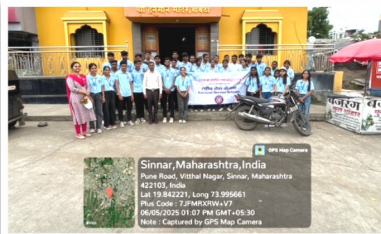
Street Play at sinner by NSS Volunteer on 05/06/2025