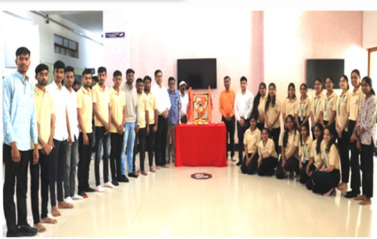
▶ Birth Anniversary of Chhatrapati Shivaji Maharaj, at K. K. Wagh College of Food Technology, Nashik. Date: 19/02/2025