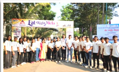
▶ Participated in Eat Right Mela at K. K. Wagh Agri & Allied College Nashik on 11/03/2025