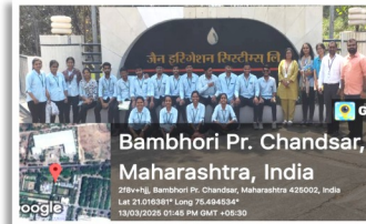
Educational visit of final year students at Jain Irrigation System Pvt. Ltd., Jalgaon During 12/03/2025 to 13/03/2025