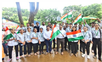
Republic Day at Playground, K. K. college of Agricultural Biotechnology, Nashik 26/01/2025