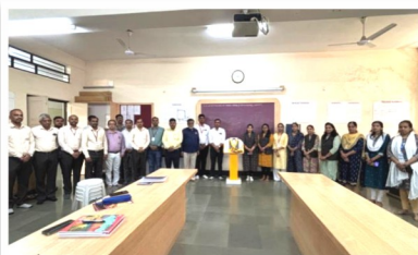
Celebrated Krantijyoti Savitribai Phule Punyatithi on 10/03/2025