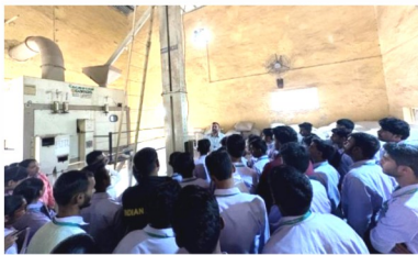
ICAR- AICRP Central Seed Processing Project on- 01/01/2025