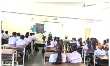
▶ Celebration of International Women Day at K.K.Wagh College of Horticulture, Nashik on 08/03/2025