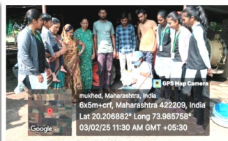
Demonstration on seed treatment (chemical and biological) for major crops of host farmer at Mukhed Date 03/02/2025