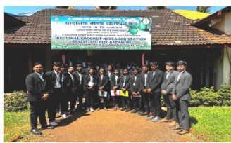
Visit to Regional Coconut Research Centre, Bhatye (06/03/2025)