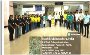
Celebrate Dr. Babasaheb Ambedkar Jayanti