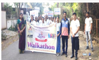
◀ Eat Right Mela & Eat Right Walkathon, at K. K. Wagh Agri & Agri Allied Colleges, Nashik Date: 11/03/2025