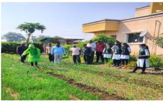
Demonstration on Integrated Weed Management in major crops at Kokangaon