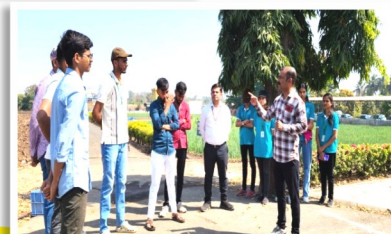
Visit to ICAR - Directorate of onion and garlic research station, Rajgurunagar, Pune on - 18/02/2025