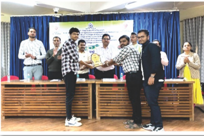
F.Y.B. Tech and T.Y.B. Tech Students got 1st Prize in Quiz Competition in Mrudgandh-Annual Social Gathering -2025