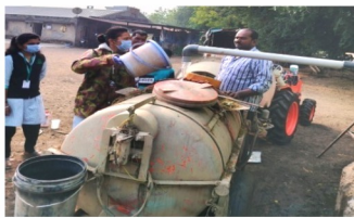
Demonstration on application of macro / micro nutrients by observing symptoms on crops