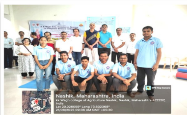
"World Yoga Day" celebrated on 21/06/2025