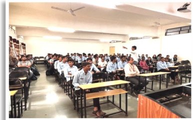
Digital Marketing and Soft skills on 22/02/2025