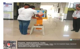
Birth Anniversary of Dr. B. R. Ambedkar, at K. K. Wagh Agri & Agri Allied Colleges, Nashik 14/04/2025