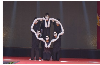
F.Y.B.tech and S.Y.B.tech and Final year Students got 3rd Prize in Mime Act inMrudgandh-Annual Social Gathering -2025