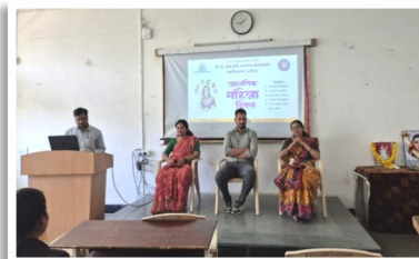
◀ International Women's Day Celebration on 08/03/2025