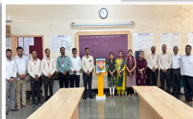
Celebrated Krantisurya Mahatma Phule Jayanti on 11/04/2025