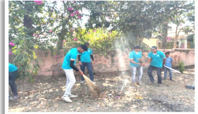
▶ Cleaning activity by NSS Volunteers at Oney village, 2024-25