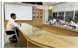
Campus drive organized on 5th May 2025 for USK Agro Sciences for Post of Development Officer and Sales Trainee