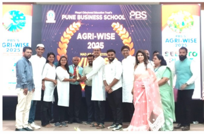
K. K. W. CABT College Student got First Winner MAD AD Competition at PBS Conference, Nigdi, Pune, 29 March 2025