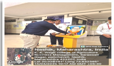
▶ Birth Anniversary celebration of Dr. Babasaheb Ambedkar on 14/04/2025