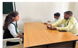
Campus drive arranged for Big basket on 22 April 2025