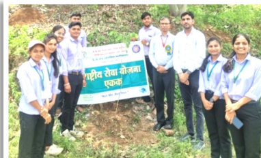
▶ Celebration of World Environment Day at Makhmalabad Farm, Nashik on 05/06/2025