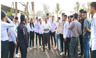
Visit to Hi-tech floriculture and vegetable research on Agriculture farm of COA, Pune. On-17/02/2025