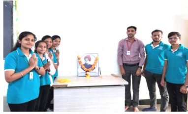
▶ Celebration of National Youth Day at K.K.Wagh College of Horticulture, Nashik on 12/01/2025