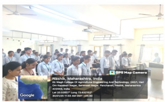
Martyrs' Day (Hutatma Din), K. K. Wagh college of Agricultural Biotechnology, Nashik 30/01/2025