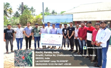
Kerala Agricultural University Rice Research Station on 21/02/2025