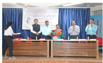
Marathi Language Day & Birth Anniversary of Poet V. V. Shirwadkar at Dr. Punjabrao Deshmukh Seminar Hall, K. K. Wagh Agri & Agri Allied Colleges, Nashik 27/02/2025