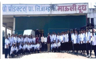
Mauli Milk Industry, Rahuri