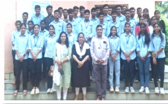
Our First year Students Visited at Sewage Treatment Plant (STP) Agar Takli on 11th June 2025