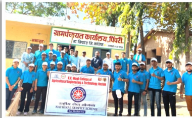
Cleaning Drive During NSS Camp at Pimpri