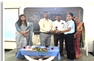
Celebrated "International Women's Day" with Program on 08/03/2025