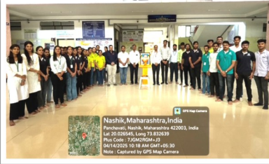
Celebrated Bharatratna Dr. Babasaheb Ambedkar Jayanti on 14/04/2025