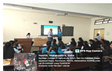
Appreciation to students for active participation in Q & A Session