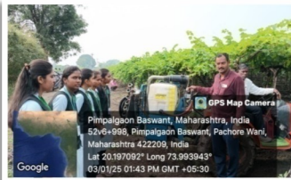
Demonstration on Agro farm machinery, at Pachore Wani, Date:03/01/2025

3 days training on Regenerative Agriculture organised by T & P cell under Mahindra Pride Classroom from 17-19/02/2025. Mahindra Pride Classroom 3 Days Training on Regenerative Agriculture is organised for last year Girls Studnet from Agriculture and allied Colleges from 17 to 19 Feb 2025