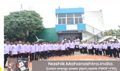
Visit to Suzlon Wind Energy Project Sinnar, Nashik on 21/06/2025