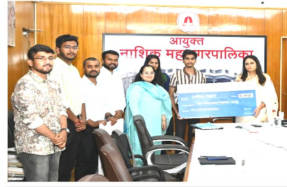
State Level Photography Contest held by The Godavari Initiative