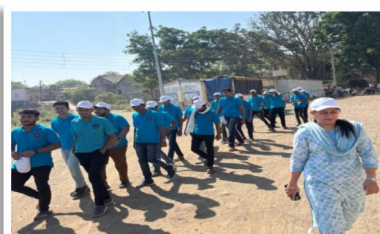
Awareness Rally During NSS Camp at Pimpri