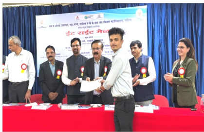
K.K.W. C.A.B.T Video Competition March 2025 Prize Distribution "Best Video"