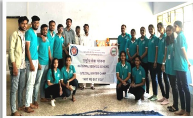
▶ Inaugural activity NSS Winter Special Camp 2024-25 at Oney village