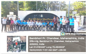
Third year students visited to Jain Irrigation Systems Ltd. Jalgaon during 14/02/2025 to 15/02/2025