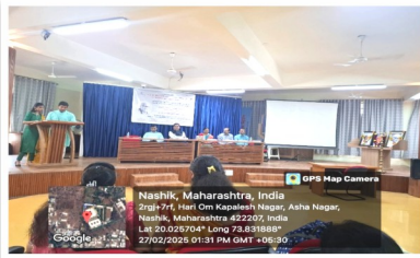
Celebrated "Marathi Bhasha Gaurav Din" on 27/02/2025