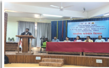
◀ Voter's Day celebrated on 25/01/2025