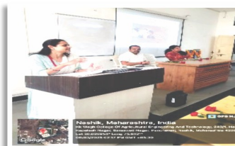
Women's Day, at K. K. Wagh College of Agri biotech, Nashik 08/03/2025