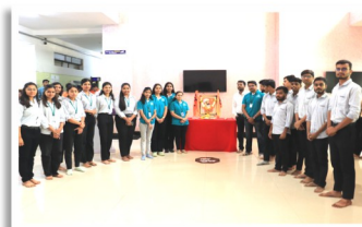
Birth Anniversary of Chhatrapati Shivaji Maharaj, at K. K. Wagh college of Agricultural Biotechnology, Nashik 19/02/2025