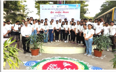
Eat Right Mela Activity Participated on 11/03/2025