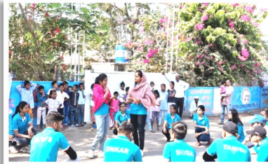
▶ Performing pathnatya by NSS volunteers at Oney village, 2024-25