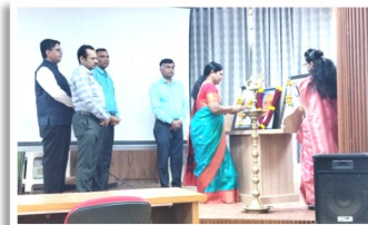
Marathi Language Day & Birth Anniversary of Poet V. V. Shirwadkar, at Dr. Punjabrao Deshmukh Seminar Hall, K. K. Wagh Agri & Agri Allied Colleges, Nashik 27/02/2025