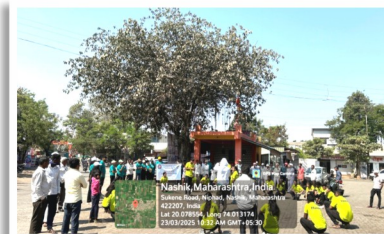
Performing of Street Play on Alcohol Prohibition, Girl Child Education and Dowry System