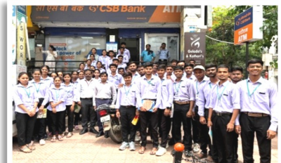
Visit to CSB Bank Canada corner Nashik 22/05/2025