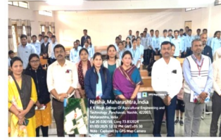
Kranti Jyoti Savitriaii Phule Jayanti celebrated on 03/01/2025