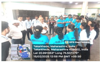
Third year students visited to Jain Irrigation Systems Ltd. Jalgaon during 14/02/2025 to 15/02/2025