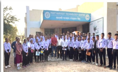
Visit to Post Harvest Techniques Project on 02/02/2025