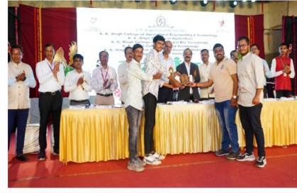
F.Y.B.Techand T.Y.B.TechStudents got 1st Prize in Group singing in Mrudgandh-Annual Social Gathering -2025