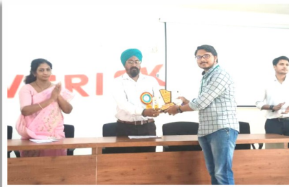
K. K. W. CABT College Student got 2nd winner at Chess at MAVERICK -2025 a State level event