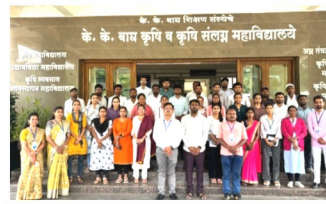
Campus drive organized for Pani Foundation conducted on 13 June 2025