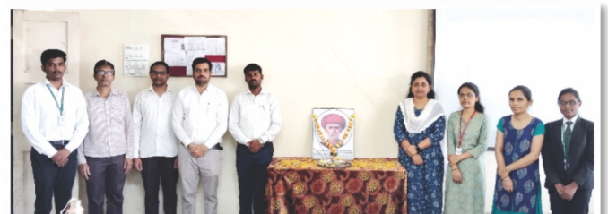
▶ Birth Anniversary celebration of Mahatma Jyotiba Phule on 11/04/2025