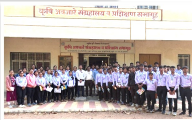
Visit to ICAR-AICRP on Farm Implement and Machinery Project on - 01/01/2025