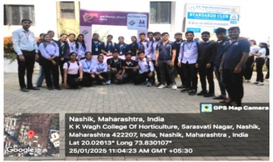
▶ Celebration of National Voters Day at K.K.Wagh College of Horticulture, Nashik on 25/01/2025