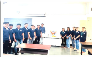
◀ Celebration of Savitribai Phule Jayanti at K.K.Wagh College of Horticulture, Nashik on 03/01/2025