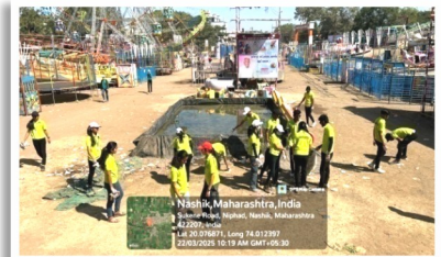
Cleaning campaign at Kasbe Sukene Village, Tal. Niphad, Dist. Nashik