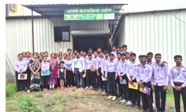
Shravarth food processing company, Konarknagar, Nashik on 20/05/2025