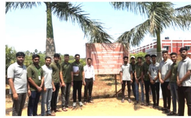
Tamil Nadu Agricultural University Demonstration Unit Ultra High Density planting of Mango 19/02/2025