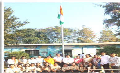
◀ Republic Day at Playground, K. K. Wagh College of Food Technology, Nashik Date: 26/01/2025