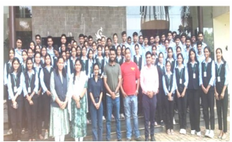
Soma Wine, Nashik