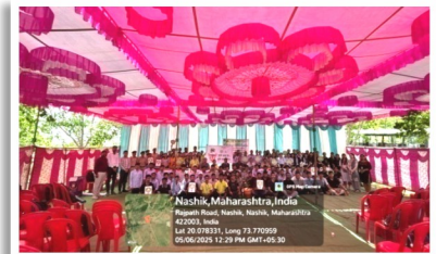
Tree Plantation Programme