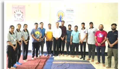
▶ Celebration of Yoga Day at K.K.Wagh College of Horticulture, Nashik on 21/06/2025