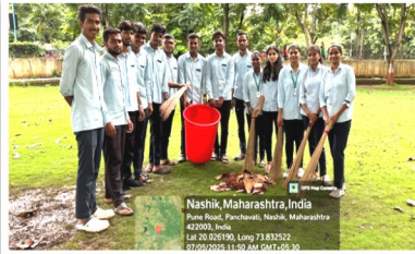
Cleaning Drive at Saraswatinagar campus on 07/05/2025