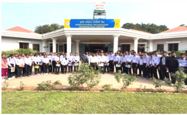
Visit to ATIC Centre at MPKV Rahuri 01/01/2025