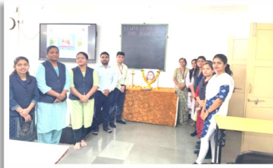
▲ Celebration of Savitribai Phule Jayanti at K.K. Wagh College of Food Technology, Nashik on 03/01/2025