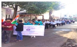
National Voters Day at K. K. Wagh college of Agricultural Biotechnology, Nashik 16/01/2025