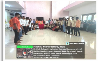
Celebrated Chhatrapati Shivaji Maharaj Jayanti at Porch of the College on 19/02/2025