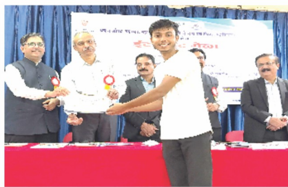
K.K.W. C.A.B.T Video Competition March 2025 Prize Distribution "Best Video"