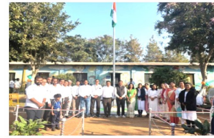
Celebrated Republic Day on 26/01/2025