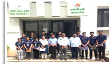
Visit of Students Bio control laboratory and Soil Analysis Laboratory at NHRDF