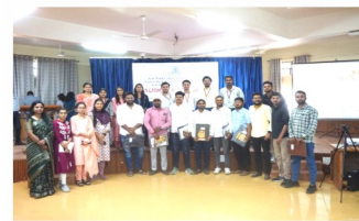
Alumni Meet 2025 at K.K.Wagh College of Horticulture, Nashik

Alumni Meet 2025 was arranged by K. K. Wagh College of Horticulture, Nashik on 22/03/2025