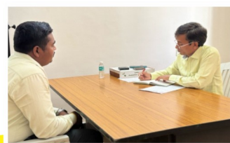
Campus interview organised for Girls students in Mauli Organics Pvt Ltd on 9 April 2025