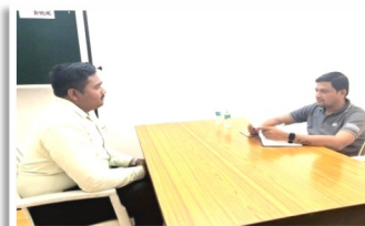
Campus Drive organized for ICL for post of Field Agronomist on 4th April 2025