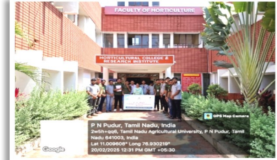
Visit to TNAU University Department of Horticulture on 19/02/2025