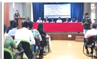
Eat Right Mela & Eat Right Walkathon, at K. K. Wagh Agri & Agri Allied Colleges, Nashik Date: 11/03/2025