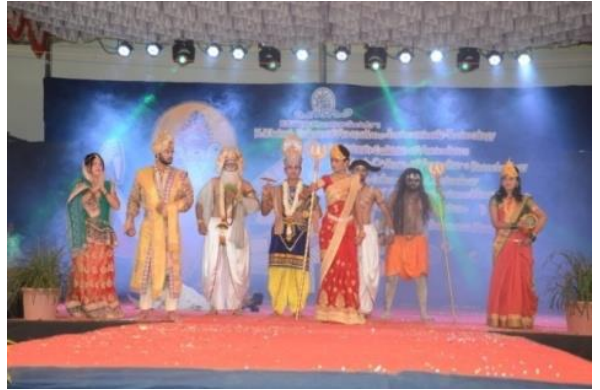
Students participated in Mrudgandh-2018