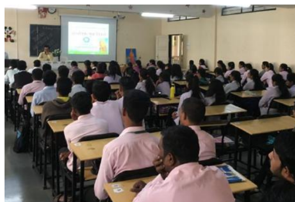
Swami Vivekananda Jayanti and International Youth day celebrated at K. K. Wagh College of Agricultural Biotechnology