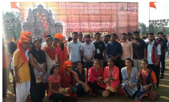
Shivjayanti celebrated at Golf Club Maidan, Trimbak Road, Nashik