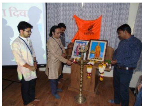
Swami Vivekananda Jayanti and International Youth Week celebrated at K. K. Wagh College of Agriculture,