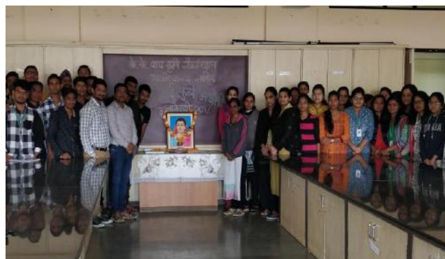
Savitribai Phule Jayanti celebrated at K. K. Wagh College of Agricultural Biotechnology