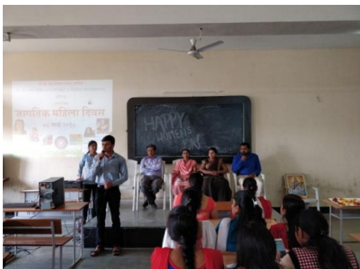
International Women's day celebrated at K. K. Wagh College of Agricultural Engineering and Technology, Nashik