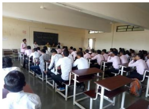
International Women's day celebrated at K. K. Wagh College of Horticulture