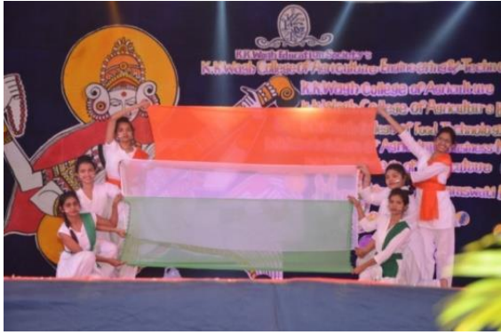
Students participated in Mrudgandh-2018