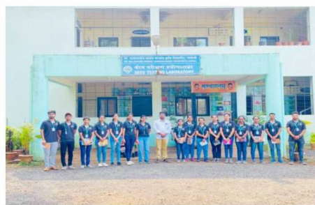
Last year (module) students visited to seed testing laboratory at Dr. B.S. K. K.V, Dapoli took information related to seed testing