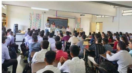
→ Teacher Day Celebration Class Room No.1, K.K. Wagh College of Horticulture, Nashik, 5/9/2023