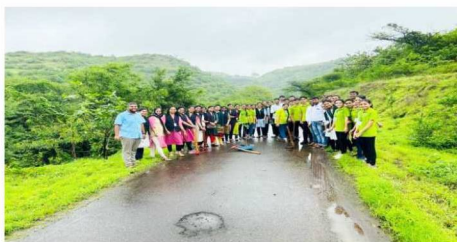
Arranged Tree Plantation at Daryai Mata Temple, Dari Matori on 01/08/2023