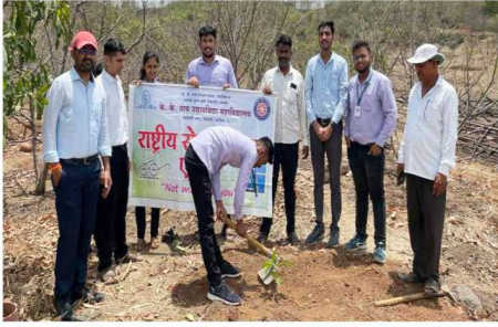
← Celebrating World environment Day at Makhamlabad on 05/06/2023