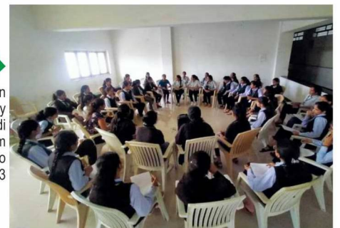
Training Programme on "Employability with Empathy for Girls" by Naandi Foundation from 19/09/2023 to 25/09/2023