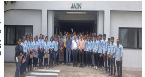
→ Third Year Students visited to Jain Irrigation Systems Ltd., Jalgaon during 07/07/2023 to 08/07/2023