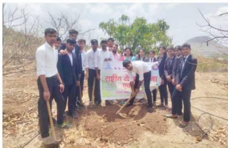
Tree Plantation on World Environment Day, 05/06/2023.