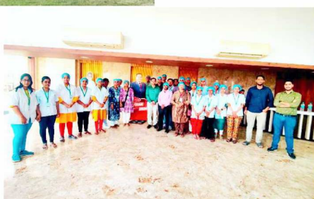
3 rd Year Students of the Food Technology visited to ICAR- NRCSS Ajmer, Rajasthan Bikaji Food Industry Bikaner, Rajasthan. On 09/10/2023 to 11/10/2023.