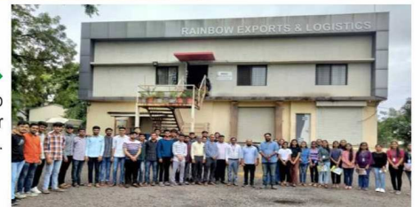
→ Third Year Students visited to Farm Plus Farmers Producer Company, Shirwade-Vani.