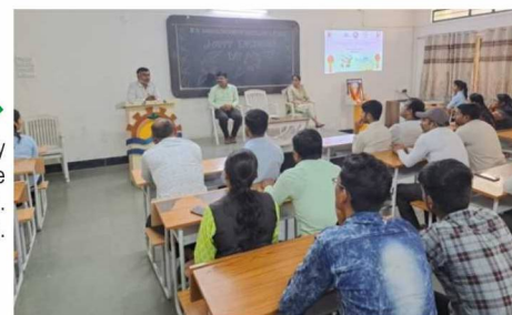
Celebrated Engineers Day by K.K.Wagh College of Agril. Engg. & Tech. Nashik on 15/09/2023.