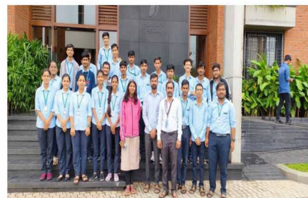
← First Year Students visited to Sahyadri Farmers Producer Company Ltd., Mohadi, Dindori, Nashik on 25/07/2023.