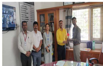
Agricultural Engineering, PIT, Parul University, Vadodara, Gujrat visited to the all departments of K. K. Wagh College of Agricultural Engineering and Technology, Nashik.