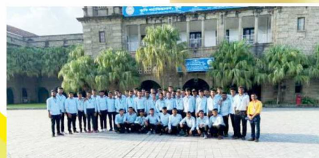
Visited to University Library, Dr. DBSKKV, Dapoli.