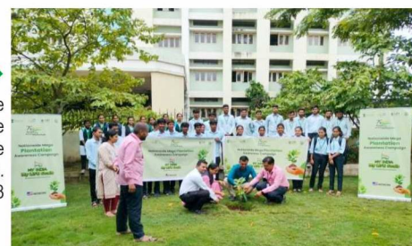
Celebrated TV9 Tree plantation Programme by K.K. Wagh College of Agril. Engg. & Tech. Nashik on 18/07/2023