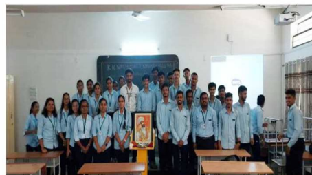
Celebrated Chatrapati Shivaji Maharaj Shivrajyabhishekh Sohala Din by K.K.Wagh College of Agril. Engg. & Tech. Nashik on 06/06/2023