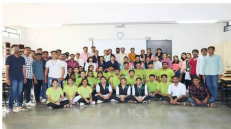
Celebrate Teacher's Day in K.K.Wagh College of Agriculture on 05/09/2023.