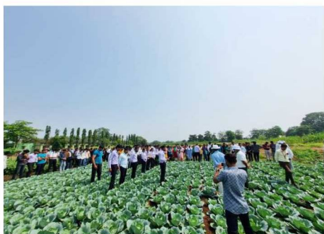
Horticulture Students visited Vegetable Production Module- Shivar Pheri on 7-10-2023, Puriyapark, Panchwati, Nashik.