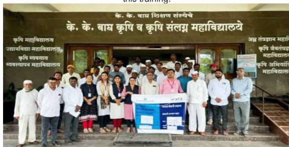
Farmers visit organized by WOTR NGO under CSR Project of Pernod Ricard India Company and Godrej Agrovet from 9 villages of Dindori Taluka On 23 rd August 2023.