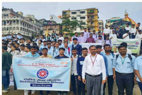
Participated in Swachhata Abhiyan with Namami Goda Foundation by K.K.Wagh College of Agril. Engg. & Tech. Nashik on 02/10/2023.