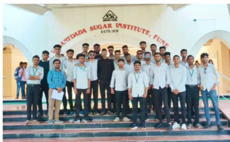
3 rd Year Students of the Agricultural Biotechnology visited to Vasantdada Sugar Institute, Manjari Bk. Pune.