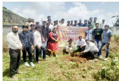
Celebrated Tree plantation Programme by K.K.Wagh College of Agril. Engg. & Tech. Nashik on 29/08/2023.