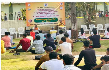
Celebrating National Yoga Day on 21/06/2023