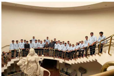
First Year Students visited to Gargoti - The Mineral Museum, SinnarDist-Nashik on 20/10/23