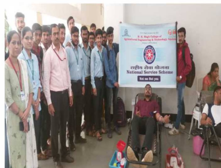
Organised Blood Donation Camp by K.K.Wagh College of Agril. Engg. & Tech. Nashik on 25/09/2023.