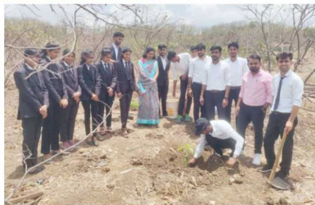
Tree Plantation on World Environment Day, 05/06/2023.