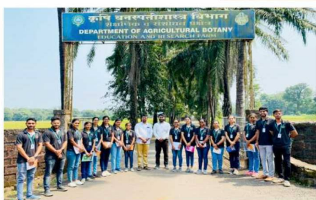
Last year (module) students visited to Dr. B.S. K. K.V, Dapoli took information related to seed production.