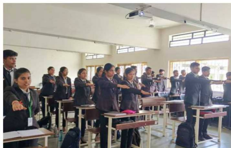
PanchPran Pratidnya under "Meri Mati, Mera Desh" on 09/08/2023