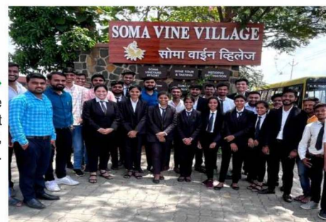
Students of Agriculture Business Management visited to Soma Winery, Nashik.