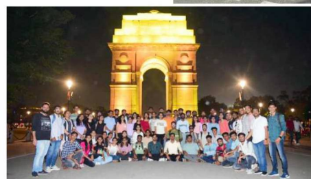
Final Year Students Visited to North India