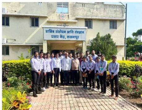
Horticulture Students visited at Pomegranate Research & Technology Transfer Centre, Lakahmapur