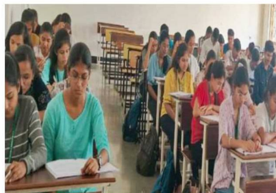
Celebrating Vachan Prerana Din on 15/10/2023.