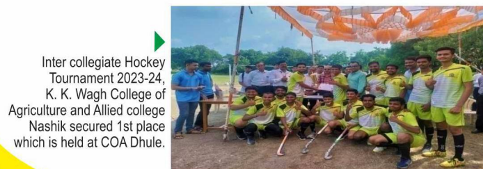
Inter collegiate Hockey Tournament 2023-24, K. K. Wagh College of Agriculture and Allied college Nashik secured 1 st place which is held at COA Dhule.