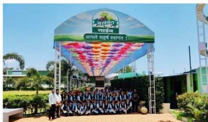
Baswant Honey Bee Park Pimpalgaon, Nashik. 17/05/2023