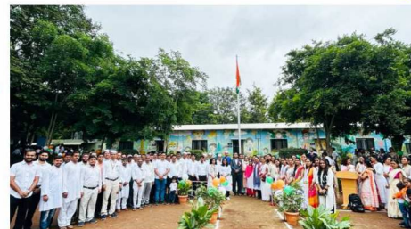
Celebrating Independence Day on 15/08/2023