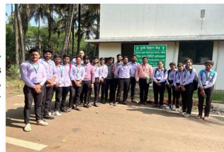
Horticulture Students visited KVK, YCMOU, Nashik.