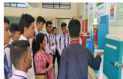
Agricultural Engineering Kashti Malegaon College visited to the all departments of K. K. Wagh College of Agricultural Engineering and Technology, Nashik.