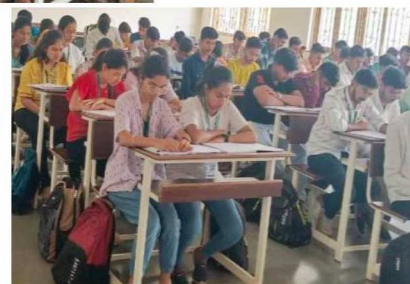
Celebrating Vachan Prerana Din on 15/10/2023.