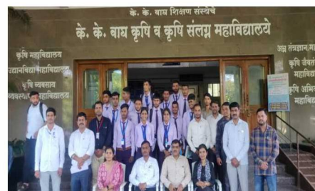
Agricultural Engineering Kashti Malegaon College visited to the all departments of K. K. Wagh College of Agricultural Engineering and Technology, Nashik.