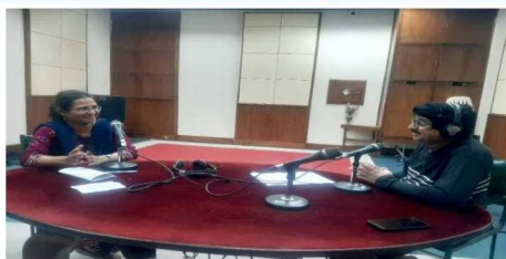
Radio Talk- Hello Kisanwani – रानभाज्या संवर्धन व संगोपन