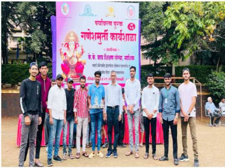
← Ecofriendly Ganesh Workshop K.K. Wagh Engineering Campus, Amrutdham, Nashik, 3/9/2023