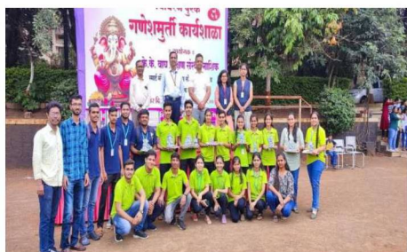
Arranged Eco-Friendly Ganesh Murti Preparation Workshop on 3/09/2023.