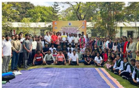
Celebrating National Yoga Day on 21/06/2023