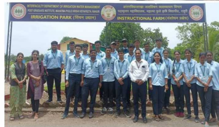
← First Year Students visited to M. P. K. V., Rahuri on 11/07/2023.