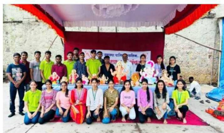
Collection of Ganesh Murti Idols at Goddagh, Ramkund and Create Awareness among People about Pollution of Rivers and Environment on 28/09/2023.