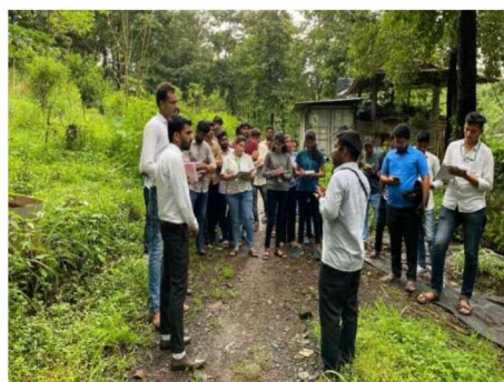
Students of Agriculture Business Management visited at Govardhan Organic Village, Wada, Palghar