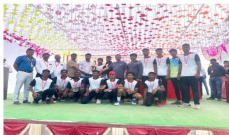
Inter collegiate Volleyball Tournament 2023-24, K. K. Wagh College of Agriculture and Allied College Nashik has secured 3 rd position which is held at Shiram College Of ABM Paniv.