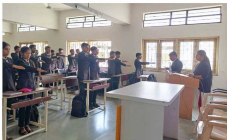
PanchPran Pratidnya under "Meri Mati, Mera Desh" on 09/08/2023