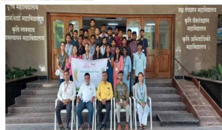
Agricultural Engineering, PIT, Parul University, Vadodara, Gujrat visited to the all departments of K. K. Wagh College of Agricultural Engineering and Technology, Nashik.