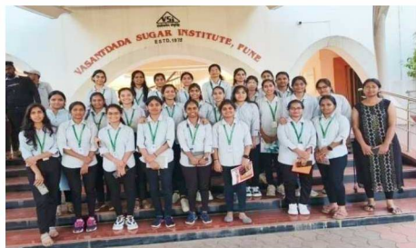
3 rd Year Students of the Agricultural Biotechnology visited to Vasantdada Sugar Institute, Manjari Bk. Pune.