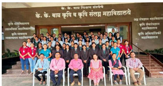
Soft Skill Training conducted Last Year Girls Students under Project "Employability with Empathy for Girls with CSR support by Mahindra Pride Classroom by Naandi Foundation" From 20 th to 26 th September 2023 In all 52 students from Agri. & Agri. Allied were participated in this training.