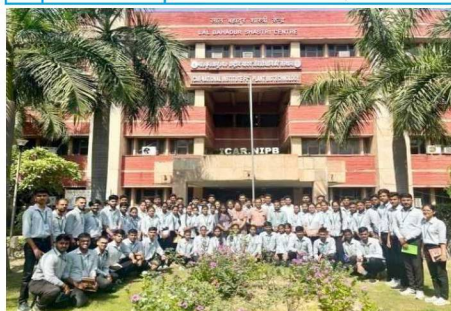
Final Year Students Visited to North India