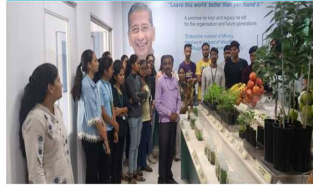
← Third Year Students visited to Jain Irrigation Systems Ltd., Jalgaon during 07/07/2023 to 08/07/2023