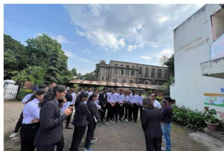
Horticulture Students visited College of Agriculture, Pune