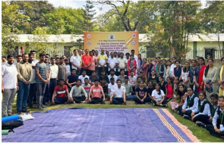
→ International Yoga day celebration at Trikon Garden, Saraswati nagar, Nashik 20/06/2023