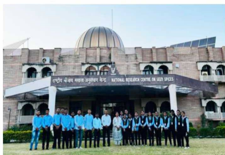
3 rd Year Students of the Food Technology visited to ICAR- NRCSS Ajmer, Rajasthan Bikaji Food Industry Bikaner, Rajasthan. On 09/10/2023 to 11/10/2023.